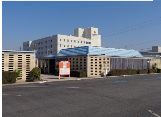
San Dimas Square

3535 SAN DIMAS STREET, BAKERSFIELD CA 93301