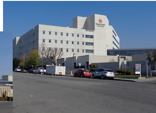
Dignity Health Memorial Hospital