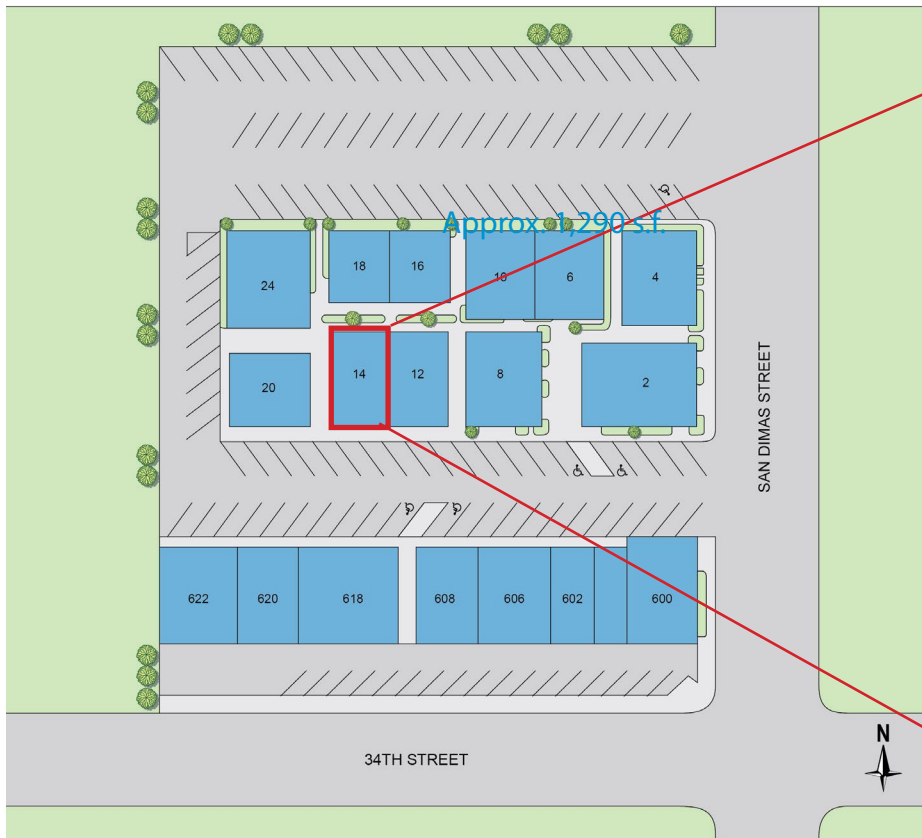
Medical Condo / Suite 14